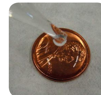
drops on a penny

On the surface of water, the attraction between water molecules is very strong. This strong attraction creates an invisible "skin" on the surface of the water that helps hold it together. This property of water is known as surface tension .