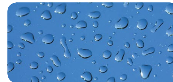
beads of water on glass

Have you ever wondered why water forms little beads on the surface of a car after it rains? It has to do with a property of water called cohesion.