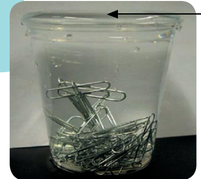
meniscus on cup