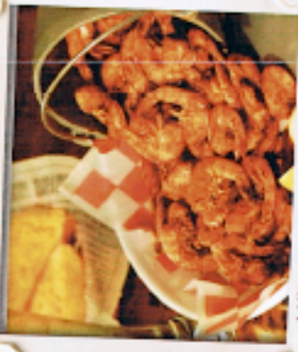
11/2 lb. Shrimper's Net Catch