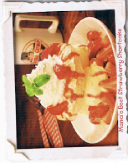
Mama's Best Strawberry Shortcake

Mama's homemade Biscuit is topped with lots of Strawberries, Ice Cream, and Whipped Cream! Just like back home! 6.99