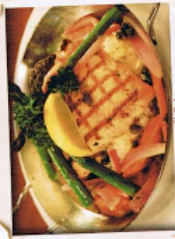
Salmon & Veggie Skillet

Lobster Claw and Shrimp. Served with Jasmine Rice, Coleslaw and a side of Mama's best Garlic Bread. 22.99