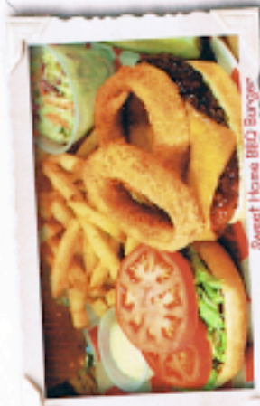
Sweet Home BBQ Burger