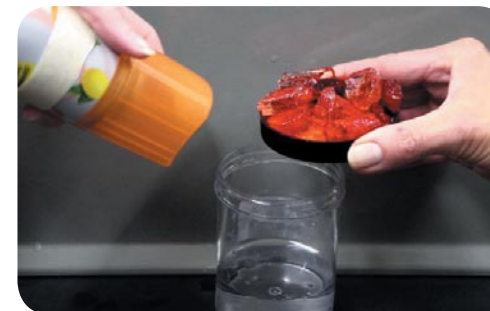
adding air freshener to jar